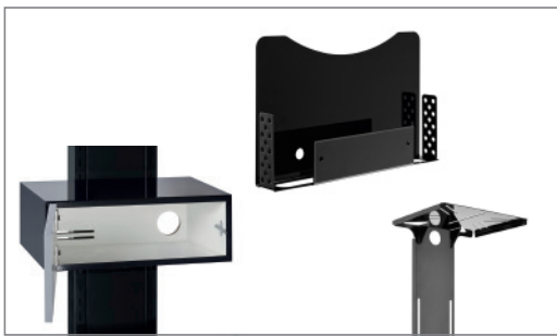
Expandable with accessories

Thanks to a wide range of optional additional items, the system can also be easily adapted to special, individual requirements.